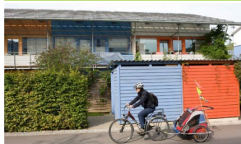
'Not anti-car, just pro-choice'... a cyclist in Vauban, Germany.

A quarter of households in Britain – more in the larger cities, and a majority in some inner cities – live without a car. Imagine how quality of life would improve for cyclists and everyone else if traffic were removed from areas where people could practically choose to live without cars. Does this sound unrealistic, utopian? Did you know many European cities are already doing it?