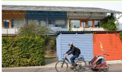
'Not anti-car, just pro-choice' ... a cyclist in Vauban, Germany.

A quarter of households in Britain – more in the larger cities, and a majority in some inner cities – live without a car. Imagine how quality of life would improve for cyclists and everyone else if traffic were removed from areas where people could practically choose to live without cars. Does this sound unrealistic , utopian? Did you know many European cities are already doing it ?